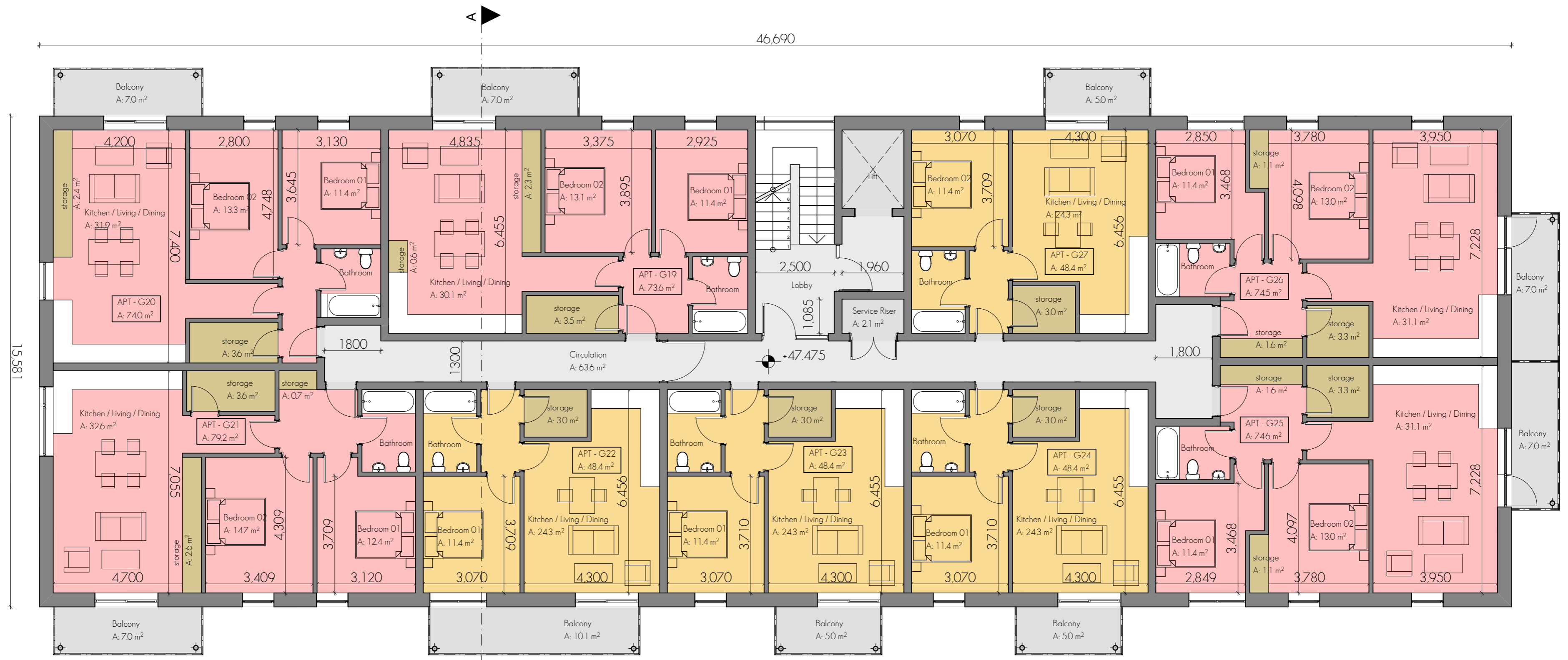
SECOND FLOOR PLAN - LEVEL_47.475 1:100